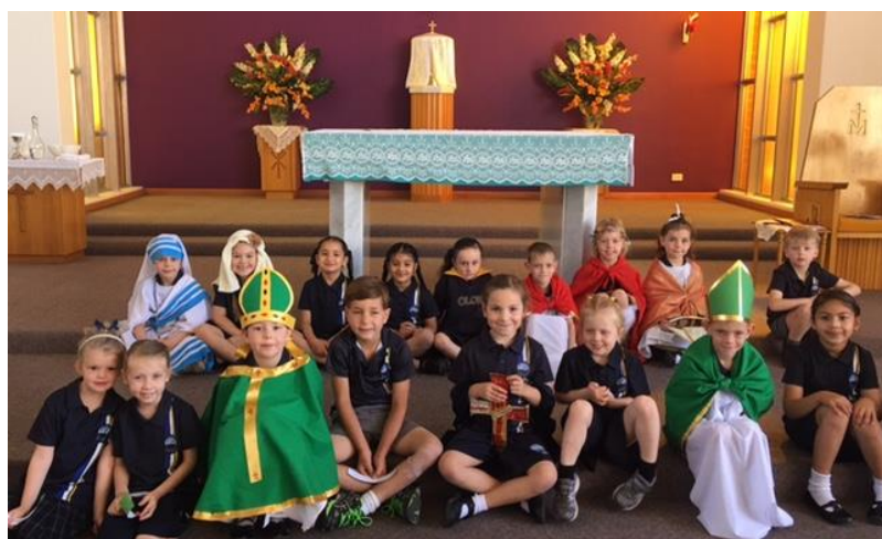
Mass Led by Foundation Thursday 10 th November