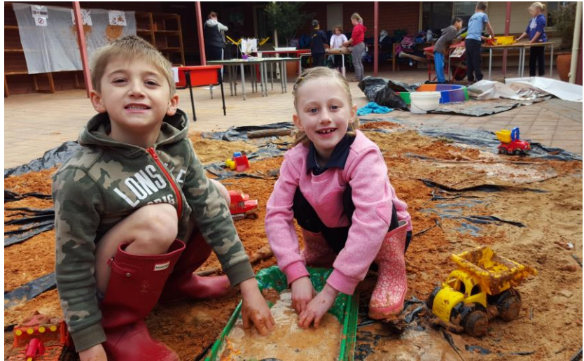
International Mud Day enjoyed by students at Our Lady of the River School.