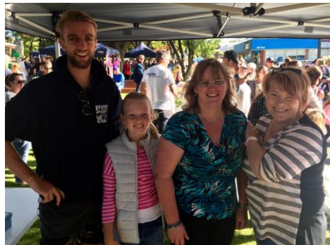
Pictured above just some of our fantastic helpers at the Berri Easter breakfast, all donations towards the event were used and raised nearly $800 for the school.